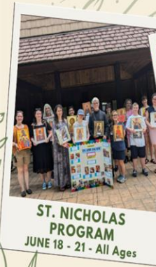
ST. NICHOLAS PROGRAM JUNE 18 - 21 - All Ages