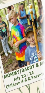
MOMMY/DADDY & ME July 20 - 24 Children 4-8 & Parents

FAMILY FEST/ LABOR DAY WEEKEND - WORK WEEKENDS (AS ANNOUNCED)