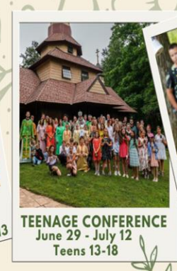
TEENAGE CONFERENCE June 29 - July 12 Teens 13-18